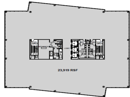
Typical Office Floor Plate

Two Harbor Point Square is a 6-story 140,222 square foot Class A office building with 23,919 sf floor plates and a 10'-0" finished ceiling.